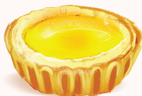
Cantonese: daan6 taat1 EGG TART 蛋撻 Mandarin: dàn tā