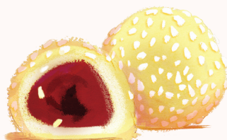
Cantonese: zin1 deoi1 SESAME BALL 煎堆 Mandarin: jiān duī