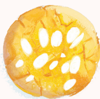
Cantonese: hang6 jan4 beng2 ALMOND BISCUIT 杏仁餅 Mandarin: xíng rén bǐng