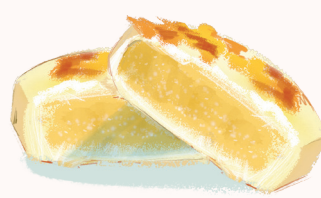
Cantonese: lou5 po4 beng2 WIFE CAKE 老婆餅 Mandarin: lǎo pó bǐng