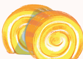
Cantonese: seoi6 si6 gyun2 SWISS ROLL 瑞士卷 Mandarin: ruì shì juǎn