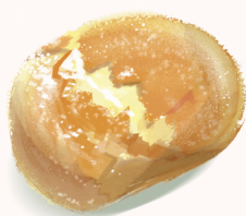
Cantonese: pan4 gu2 daat3 APPLE TART 蘋果撻 Mandarin: píng guǒ tā