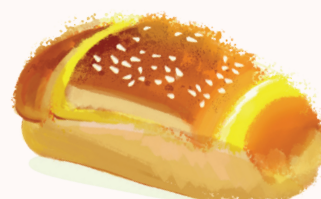
Cantonese: gai1 mei5 baau1 COCKTAIL BUN 雞尾包 Mandarin: jī wěi bāo