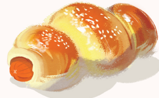
Cantonese: coeng4 zai2 baau1 HOT DOG BUN 腸仔包 Mandarin: cháng zǐ bāo