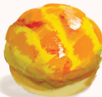
Cantonese: bo1 lo4 baau1 PINEAPPLE BUN 菠蘿包 Mandarin: bō luó bāo